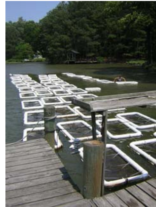
Oyster Project Site Northumberland County Virginia

The water filtering capacity of the native Chesapeake Bay oyster is widely recognized. While the native oyster population and industry have been decimated by disease and predation, some watermen are successfully raising oysters in confined aquaculture settings